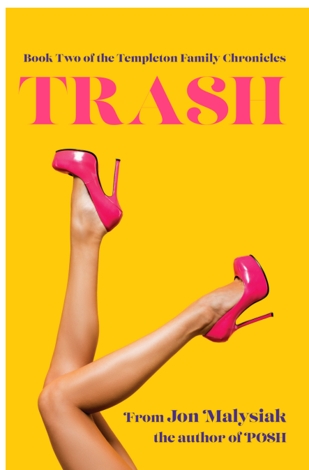
Trash — Book Two (new release)

The Templeton Family Chronicles by Jon Malysiak — publication 9 July 2026